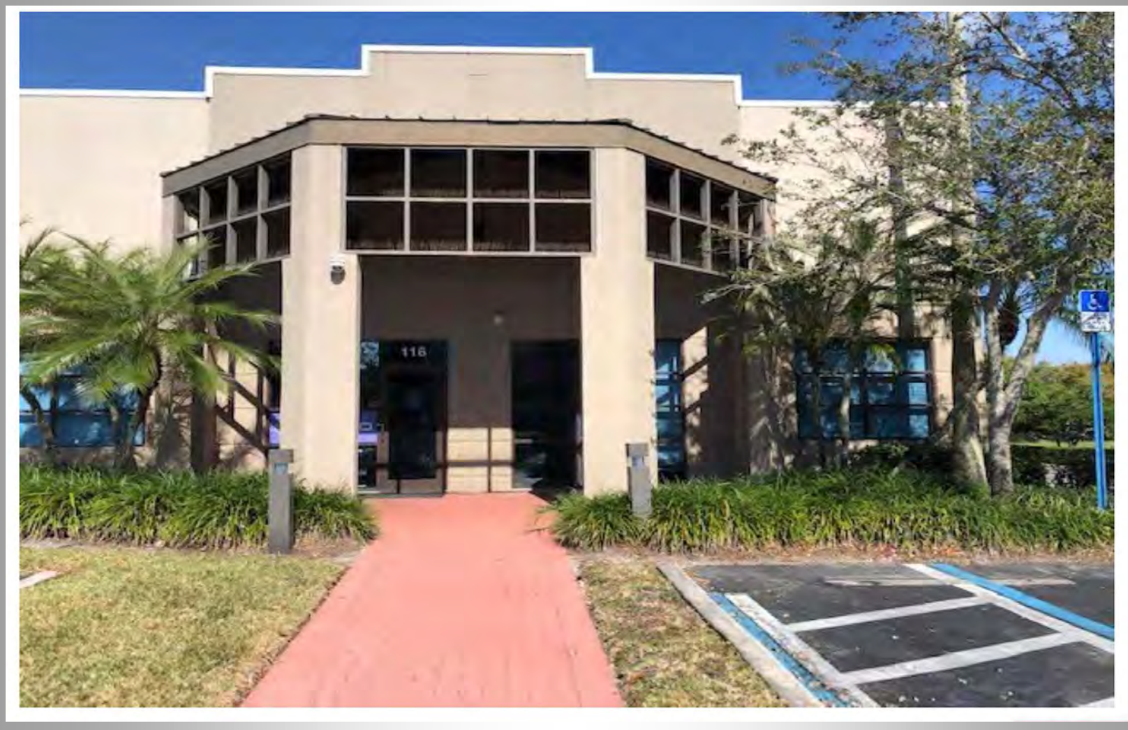
Suite 116 - 6,562 Square Feet