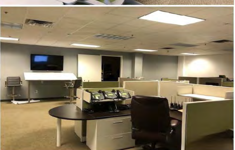
Suite 116 - 6,562 Square Feet