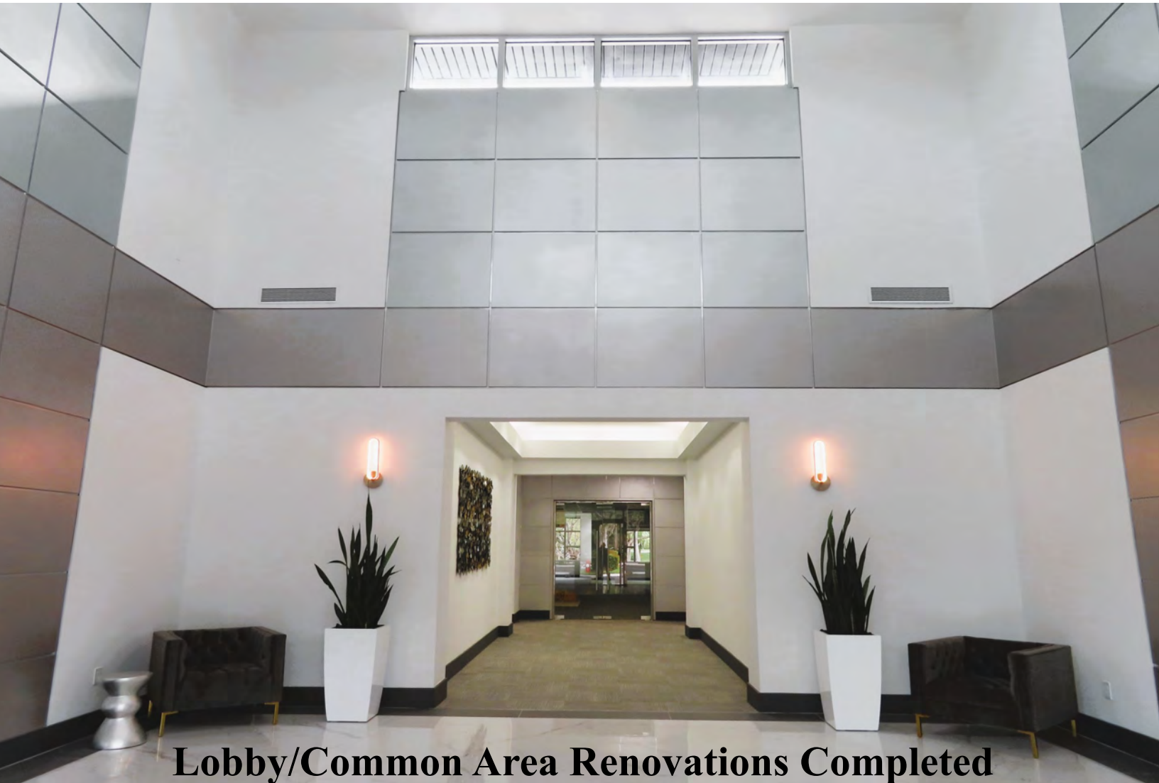
Lobby/Common Area Renovations Completed

3040/3050 Universal Boulevard, Weston, FL 33331