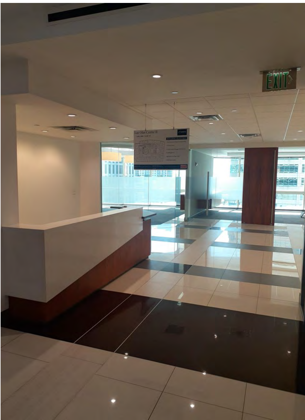
Reception area with multiple conference rooms (all glass; East view)