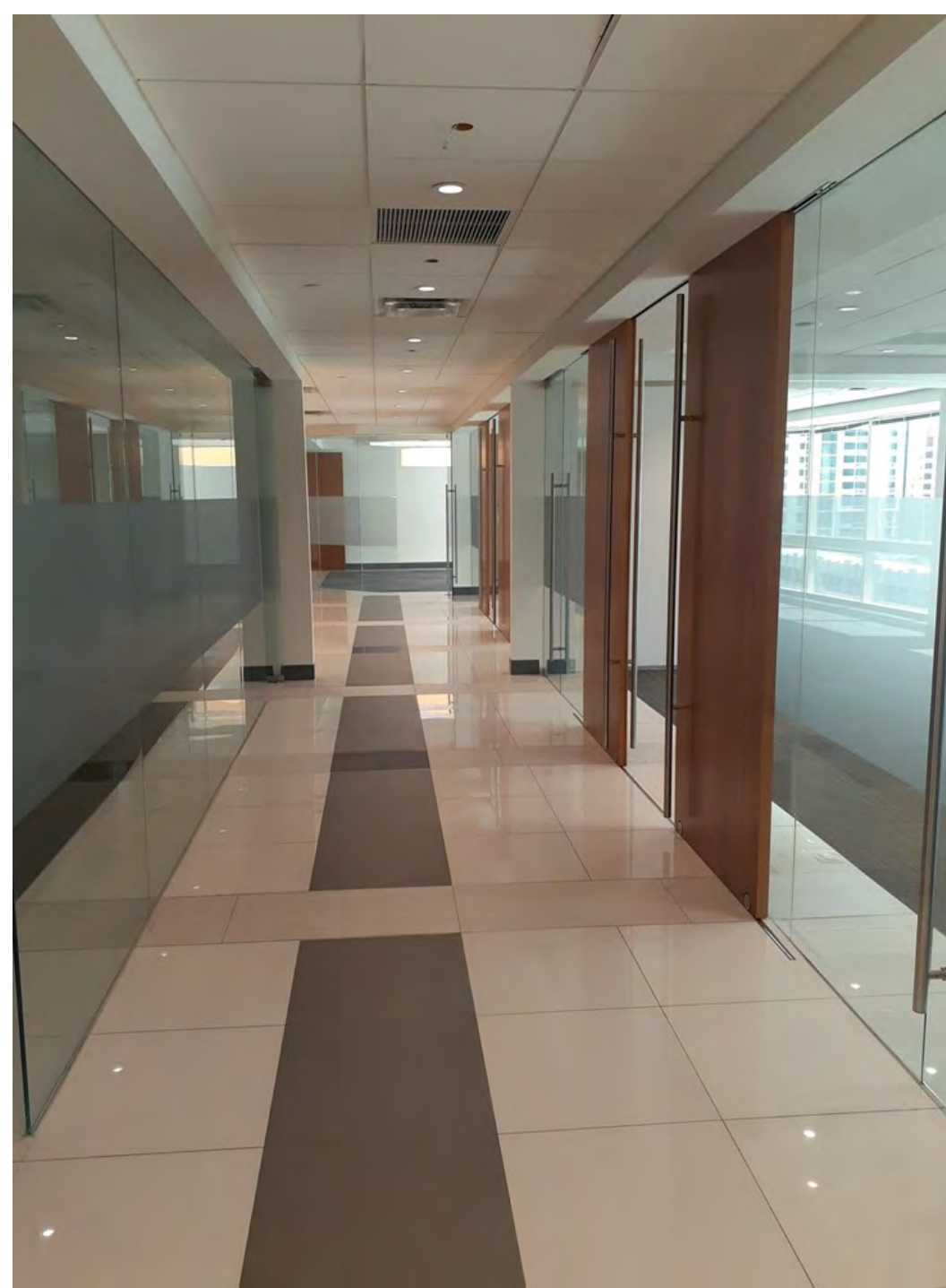
Hallway leading to reception (multiple glass conference rooms)