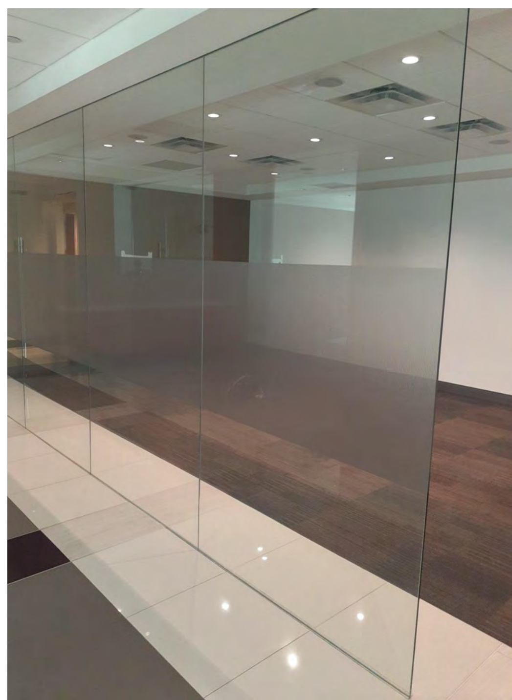
Side conference room (near reception area)