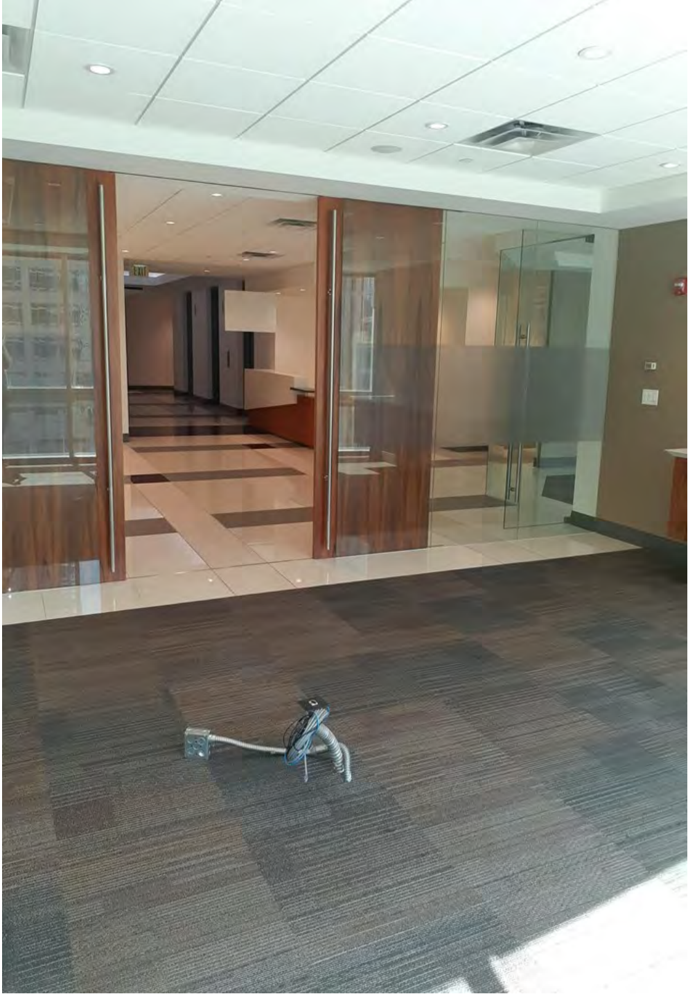
Inside Large Conference Room