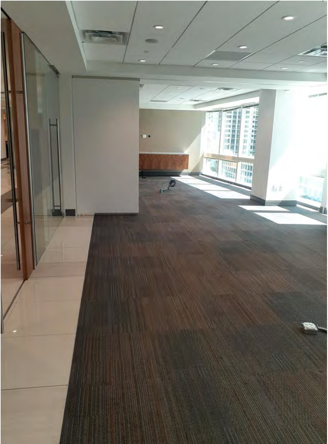
Another view of large conference room (*Note: built-in room divider)