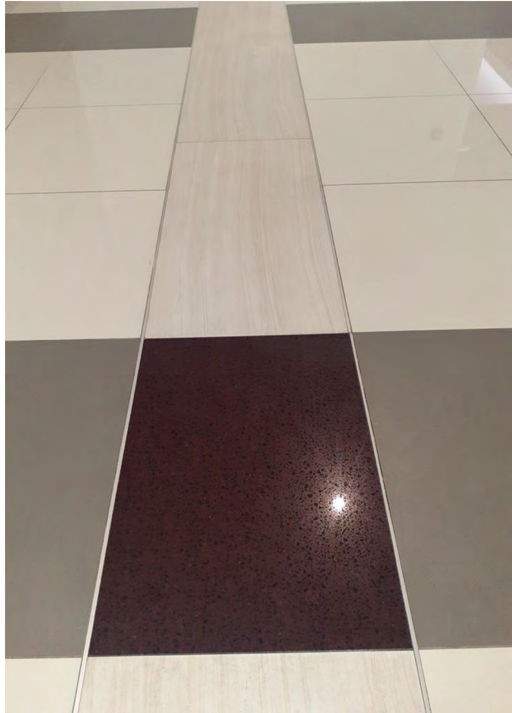
Closer look at amazing reception area flooring