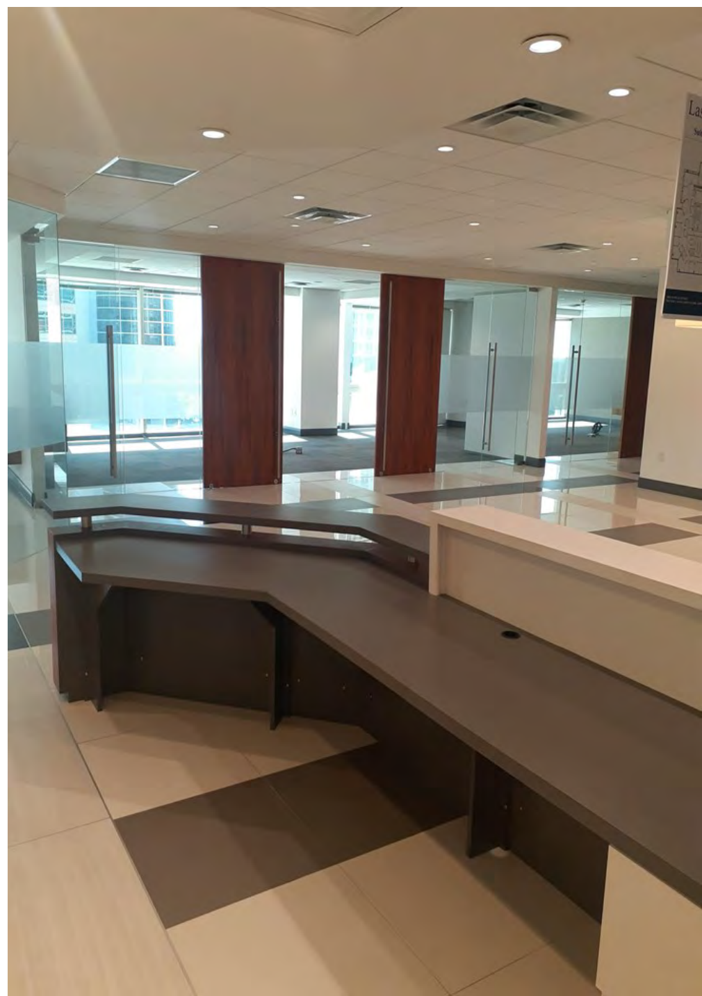
Reception/conference room area