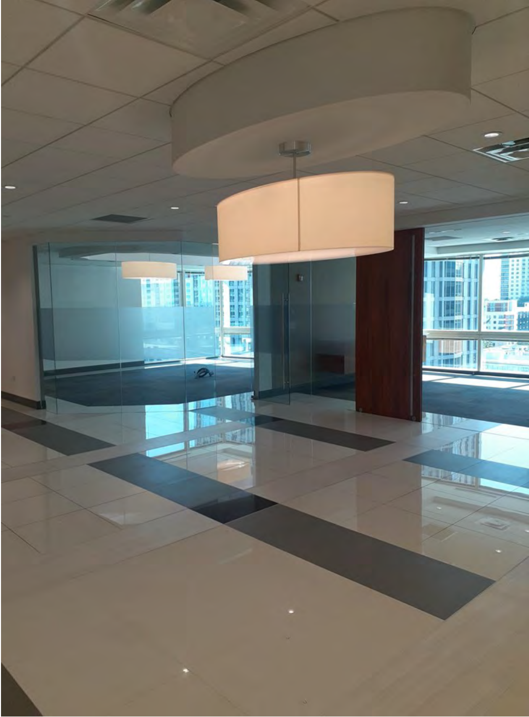
Conference Room/Reception Area