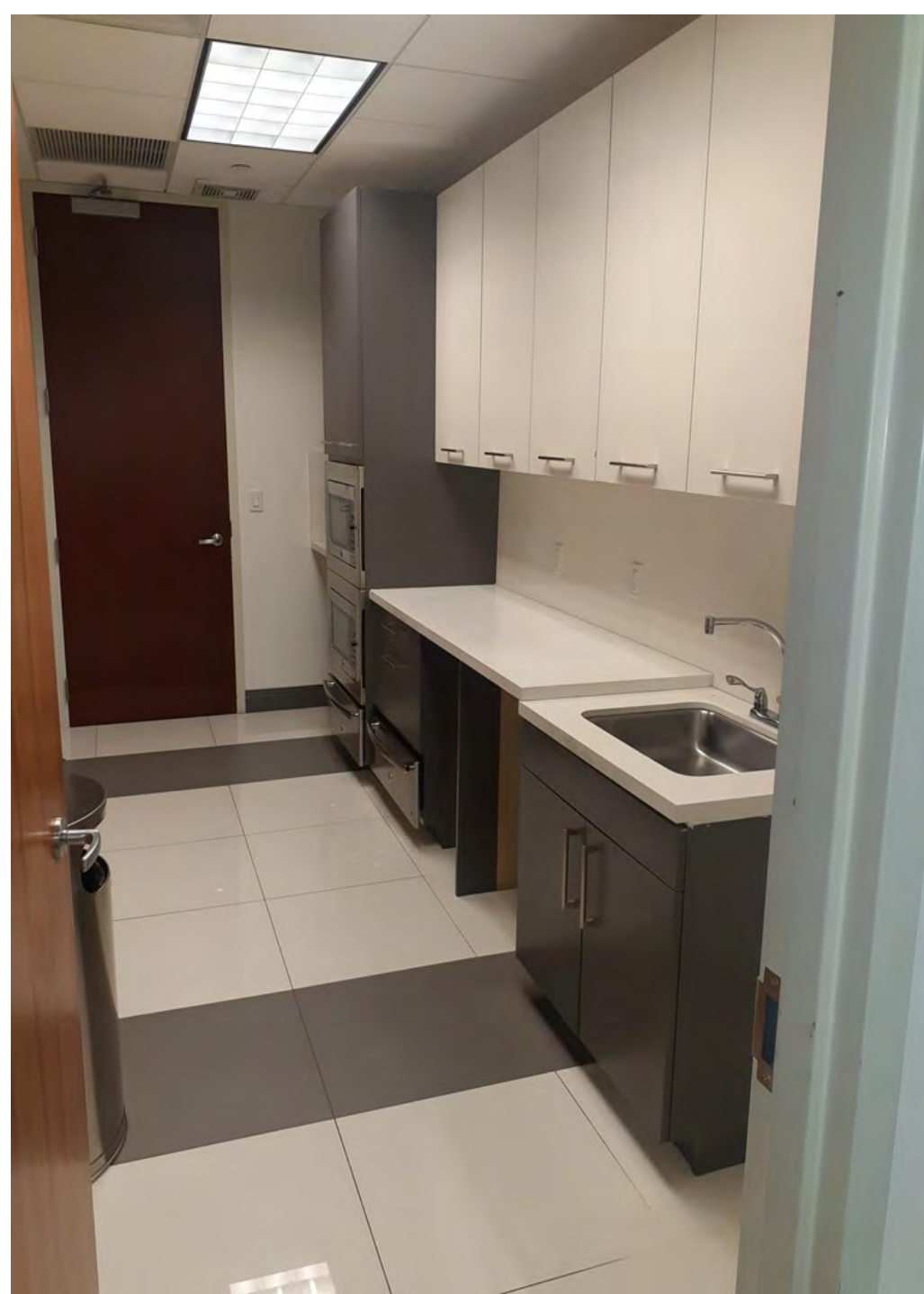
Coffee station/catering facility for conference rooms